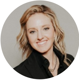
Cami Community Member

YOU DESERVE SUCCESS... IN EVERY AREA OF YOUR LIFE.